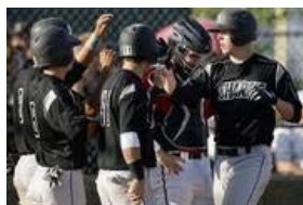
HSGT BASEBALL: Santiago 14, Centennial 3