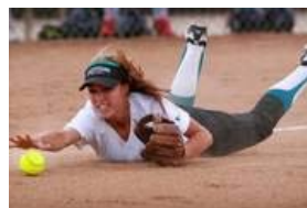
HSGT SOFTBALL: King 4, Santiago 0