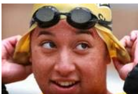
HSGT SWIMMING: CIF-SS Division 4 Preliminaries